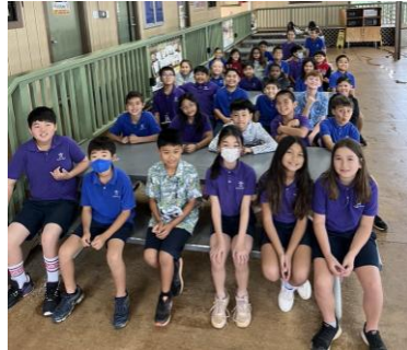
Hanalani 4 th Graders