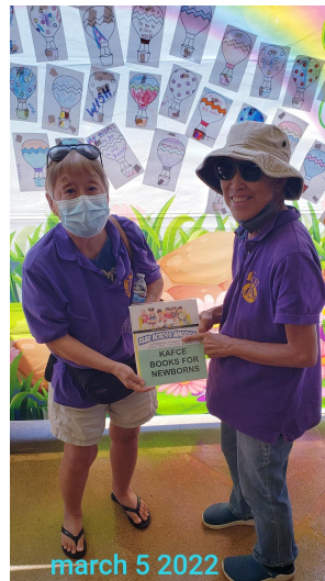
march 5 2022