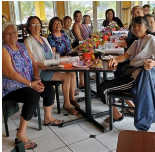
Club Musubi Members at a restaurant