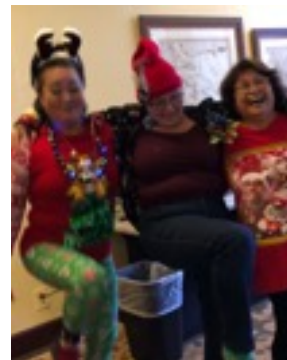
Remembering the Joy of Christmas Past . . .