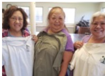
Pic below: Busy crafters braiding t-shirts