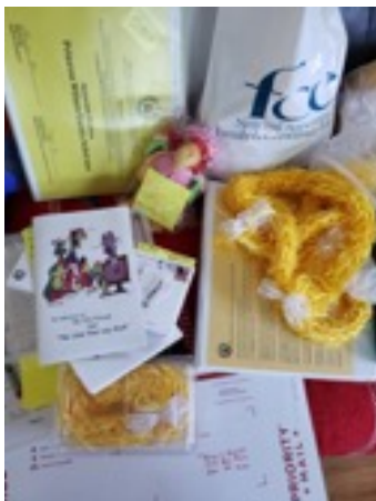
Pic Below R: Koa Rine, 3rd Place, Kapaa Elementary

Pic Below L: Awards in a Box included; lei, cash, certificate, booklet, & "Icky" the stuffed parrot mascot