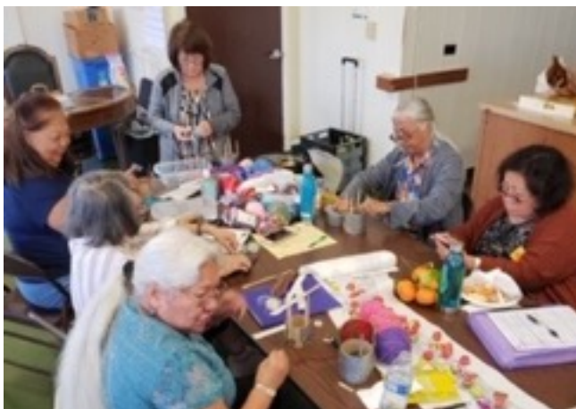
Pic below: KAFCE crafters busy making yarn leis and jigs