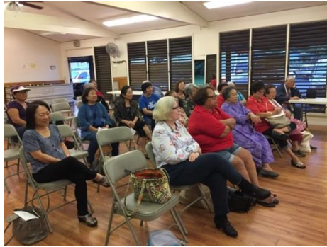
The Hungry Crowd