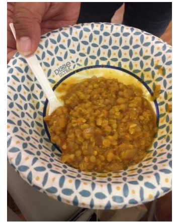
Ornish Indian Lentil Soup