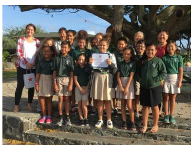
St John Vianney Class