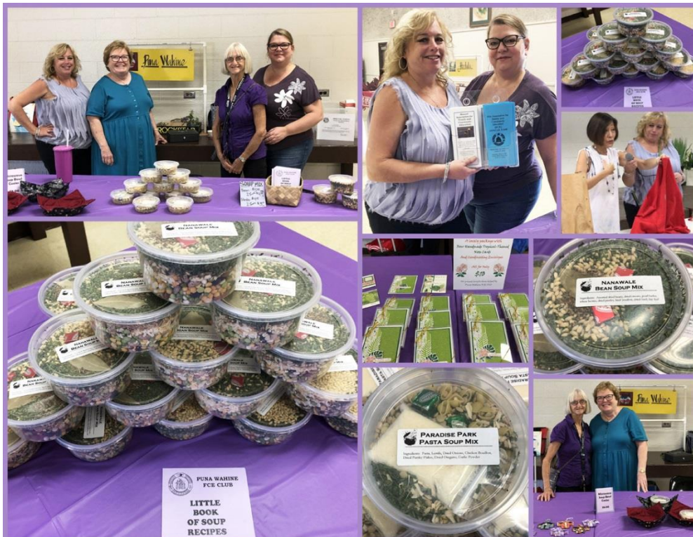
Puna Wahine FCE Club of Hilo Council shows off their signature soup mixes and wares during the FCE Fair. The fair was hosted by Ho’aloaha and University Heights clubs on May 4 th . ↑