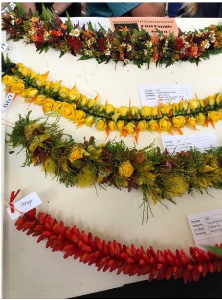
2019 Annual Lei Contest Entries ↑