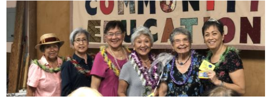
Newly installed Windward Oahu officers for 2019 ↑