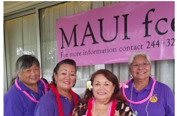
Kauai's delegation at FCE convention on Maui →