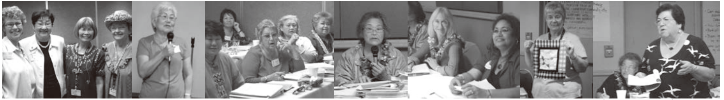
Hawaii FCE Mid-Year Board Meeting