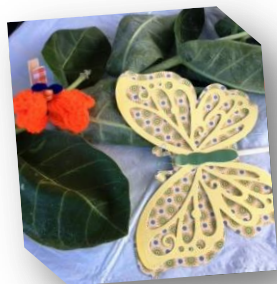
Butterfly craft and crown flower stalk which is a butterfly favorite for laying their eggs.

Spring fever act – The Nutcracker Suite! Some of our events, Peruvian food, geography, people and culture, nature, government and economy and history in February. March takes us on a Chocolate Tour – lots of information about the cacao trees growing on the North Shore and how the beans are processed and made into the tasty chocolate bars.