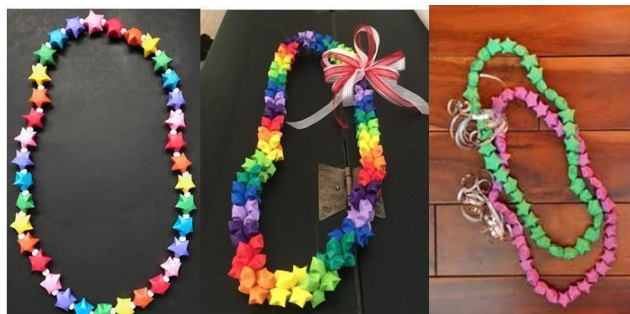
Iris Fukunaga's Origami stars