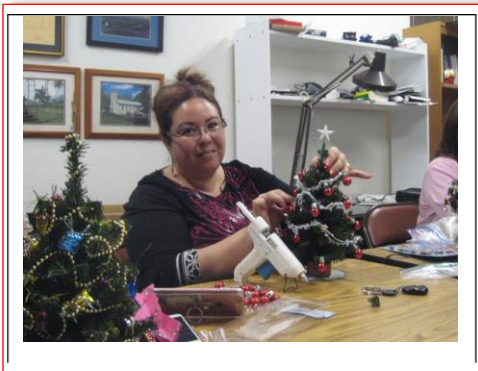
Hanalike Kakou member decorating the tree