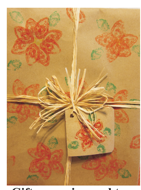
Gift wrapping and tag

Christmas Flower Stamp is an adaptation of the corrugated rose stamp from marthastewart.com