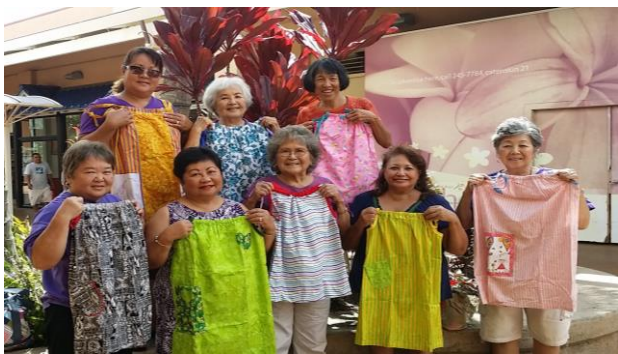
Kauai FCE Council members display their Dress a Girl dresses