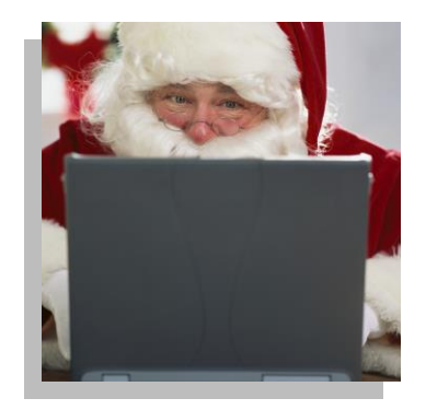
He's watching you on Facebook!