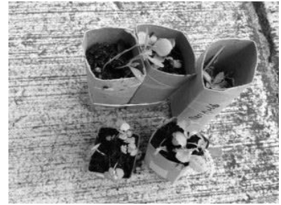
Seedlings placed inside toilet tissue rolls

seedlings, and placed directly into the participant’s gardens as they are biodegradable. Approximately 80-100 visitors participated in this fun, easy, and enjoyable project.