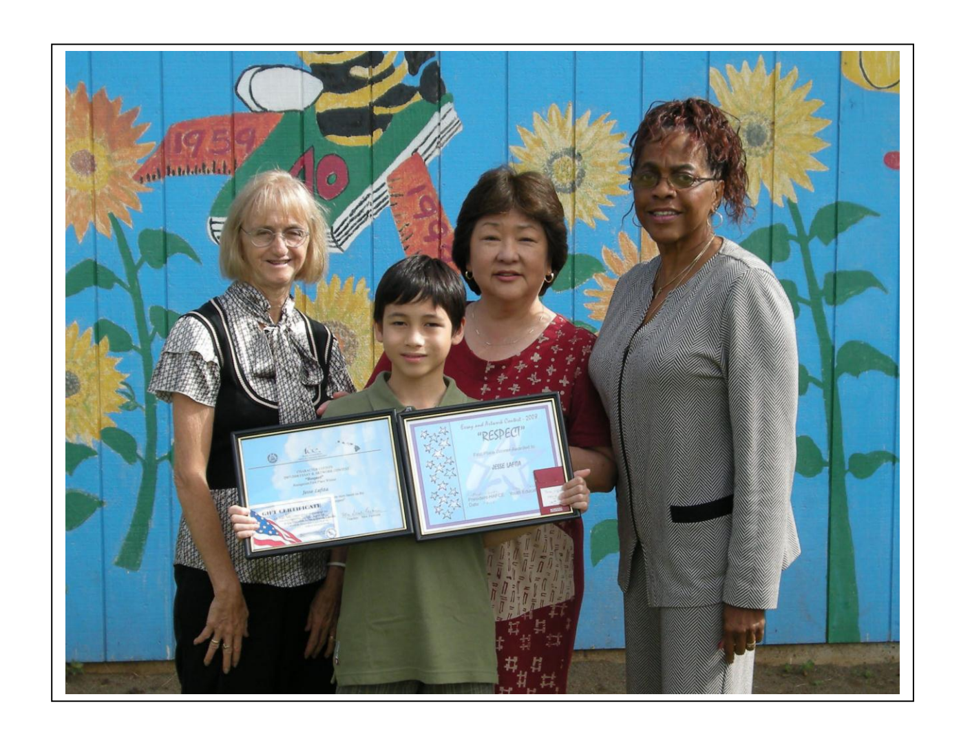
FCE - Character Building for Hawaii's Youth