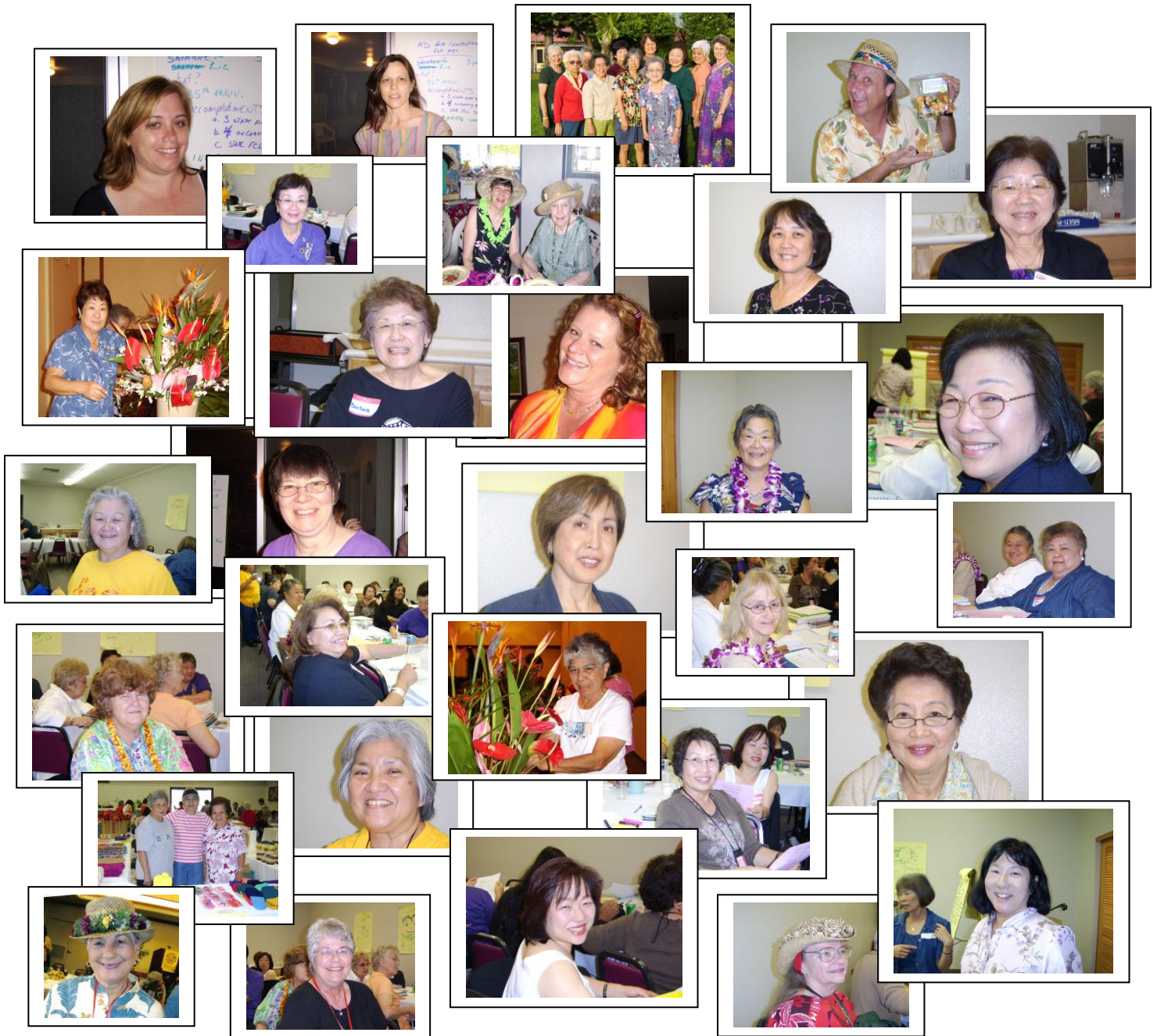
The Many Faces of FCE